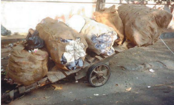
Materials reclaimed for recycling save transport and disposal costs