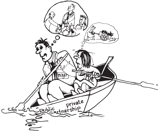
Cartoon 1: Domination by local government