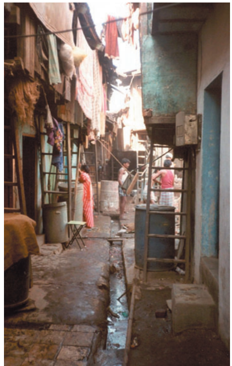
Difficult access in unplanned areas