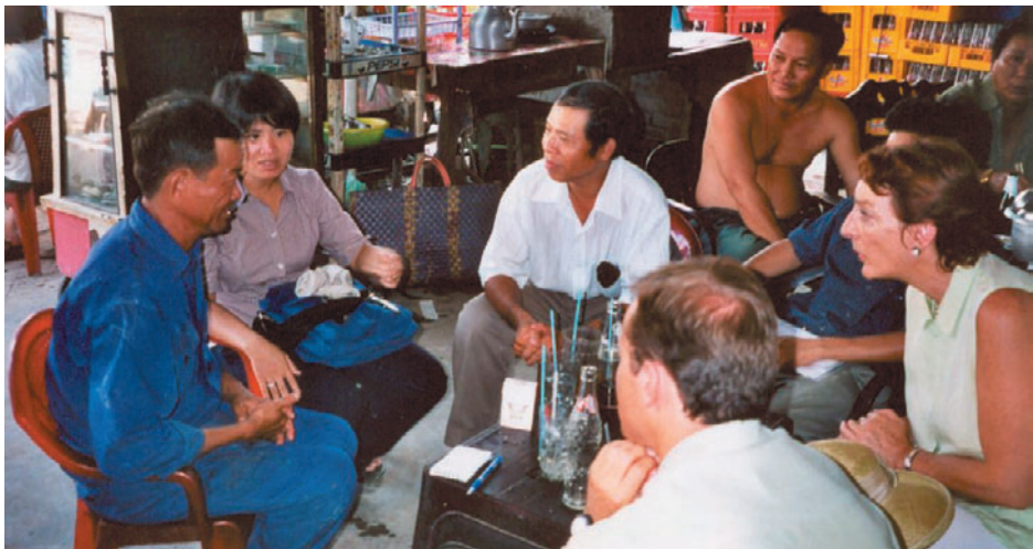
Community members should be involved in making decisions